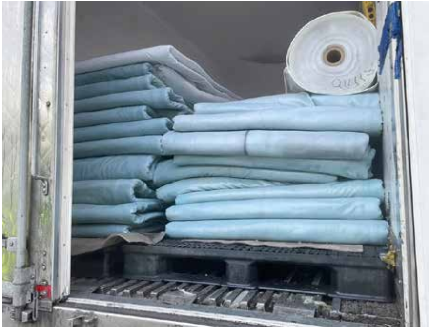
Liner materials are designed and manufactured for each individual pressure pipe installation, and shipped to the site in refrigerated trucks

With four distinct phases, the project is categorized by the pump stations along the pipeline's alignment in the NCSD collection system. The force mains carry flow from the following pump stations, which comprise the breakdown of work scope.