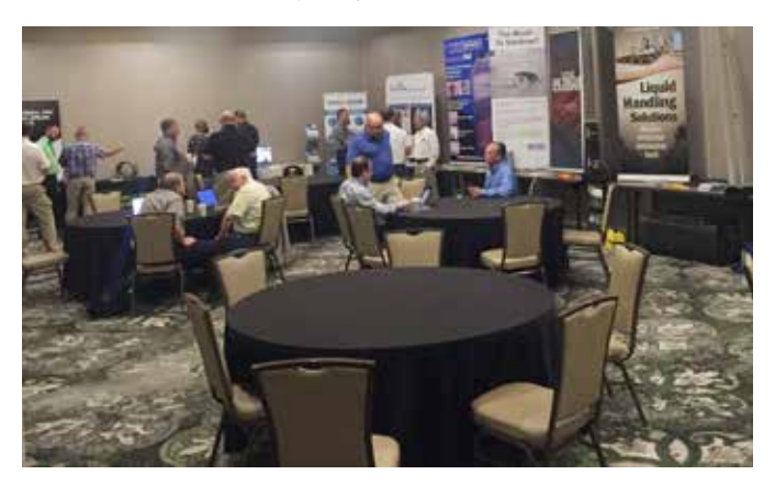
Great opportunity to resource knowledgeable trenchless vendors

For information dates and locations of future SESTT Trenchless Technology, SSES and Buried Asset Management seminars and virtual webinars planned for the Southeast, visit: