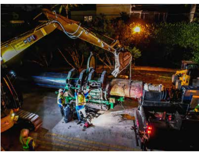
Butt fusion of the pulling head onto 36-inch HDPE piping

environments puts greater emphasis on guidance accuracy and as-built precision, necessitating a more careful review of project alignments and use of cutting-edge technologies. The Phase 1 and 2 projects utilized acceptance criteria for alignments through the use of specific critical alignment locations and provided specifications for construction methodology and sequencing to accommodate the current and future planned construction as well as technological limitations of pipe installation by HDD.