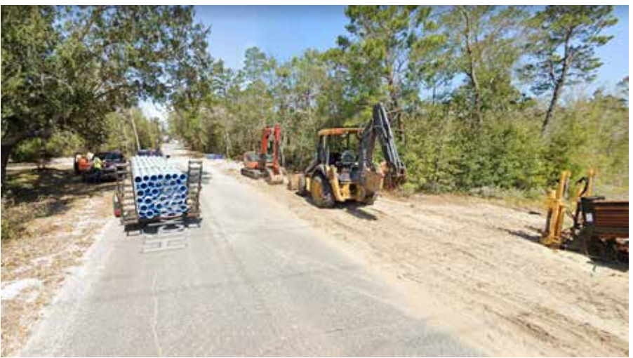
Contractor utilized the cartridge style assembly method

Project Type: Potable Water Application: Horizontal Directional Drilling (HDD) Owner: Midway Water System Inc. Product Used: Certa-Lok® RJIB (C900) Contractor: Evans Contracting Inc. Engineer: Fabre, a Bowman Company