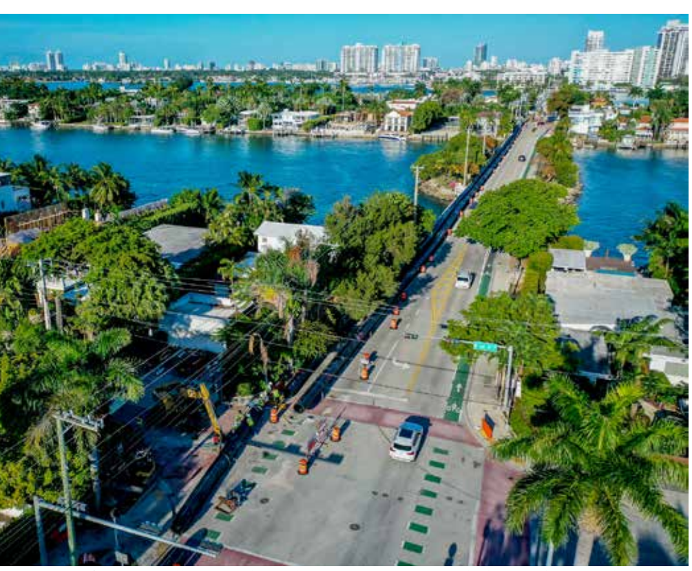
The HDD installation was designed to navigate a narrow corridor between the proposed new bridge foundations and edge of right-of-way

and future bridge infrastructure along with right-of-way constraints. Miami-Dade County is currently undergoing the design of the replacement bridges within the corridor due to the extremely poor condition of the existing bridges, which were originally constructed in 1926. Project design required extensive coordination with Miami-Dade County and their replacement bridge design consultant, who are upgrading and expanding all of the historical Venetian Causeway bridges over the next 5-7 years, to avoid conflicts with the future bridge infrastructure.