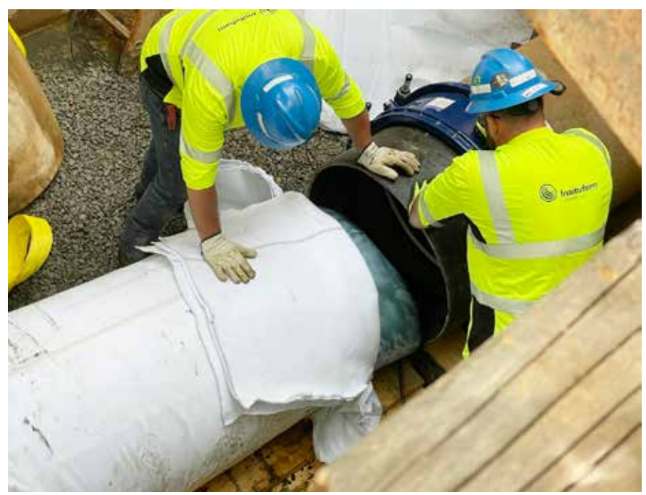
Using an updated methodology, termination of the liner was done outside of the host pipe

The final step prior to the installation of the mechanical fittings and closure piece is a hydraulic pressure test, to verify that the liner has been installed