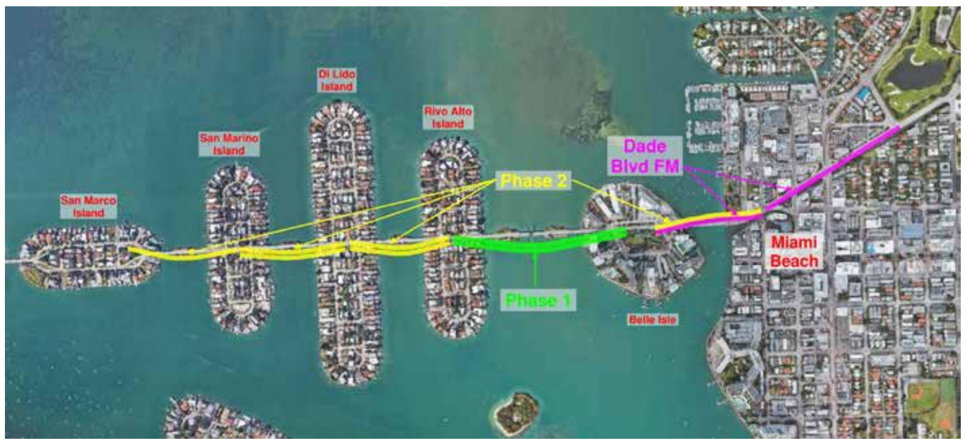
Phasing of the Venetian Causeway water and sewer replacement projects

In addition to the regulatory and social hurdles involved in the historic corridor, the project included a vast number of technical constraints including a large number of existing and planned future utilities, bridge load restrictions, and complex HDD geometries with minimal radii. However, the key design challenge for the project was the need to coordinate the proposed pipe alignments with existing