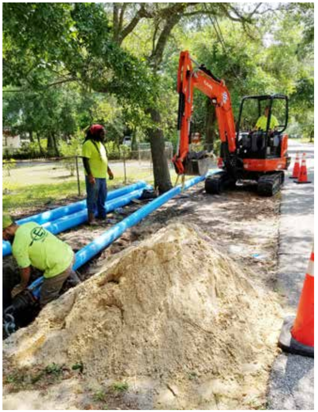
Maximum drill length was 2500 feet