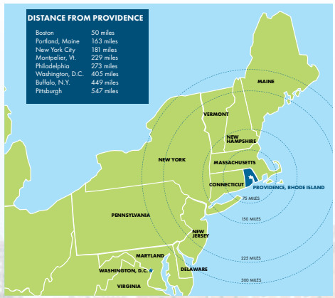
Providence is an easy day's drive from most cities in the Northeast