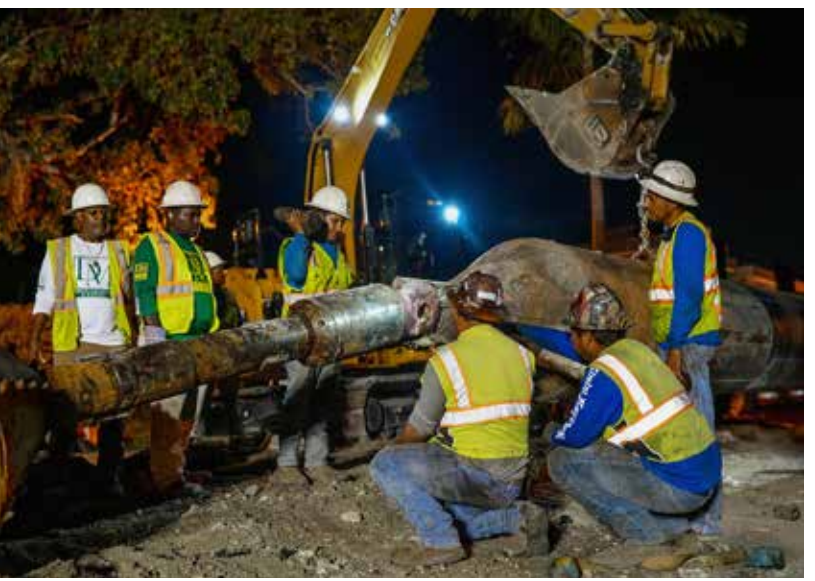
DMSI and Centerline staff inspect the connection between the reamer and pipe string prior to pullback