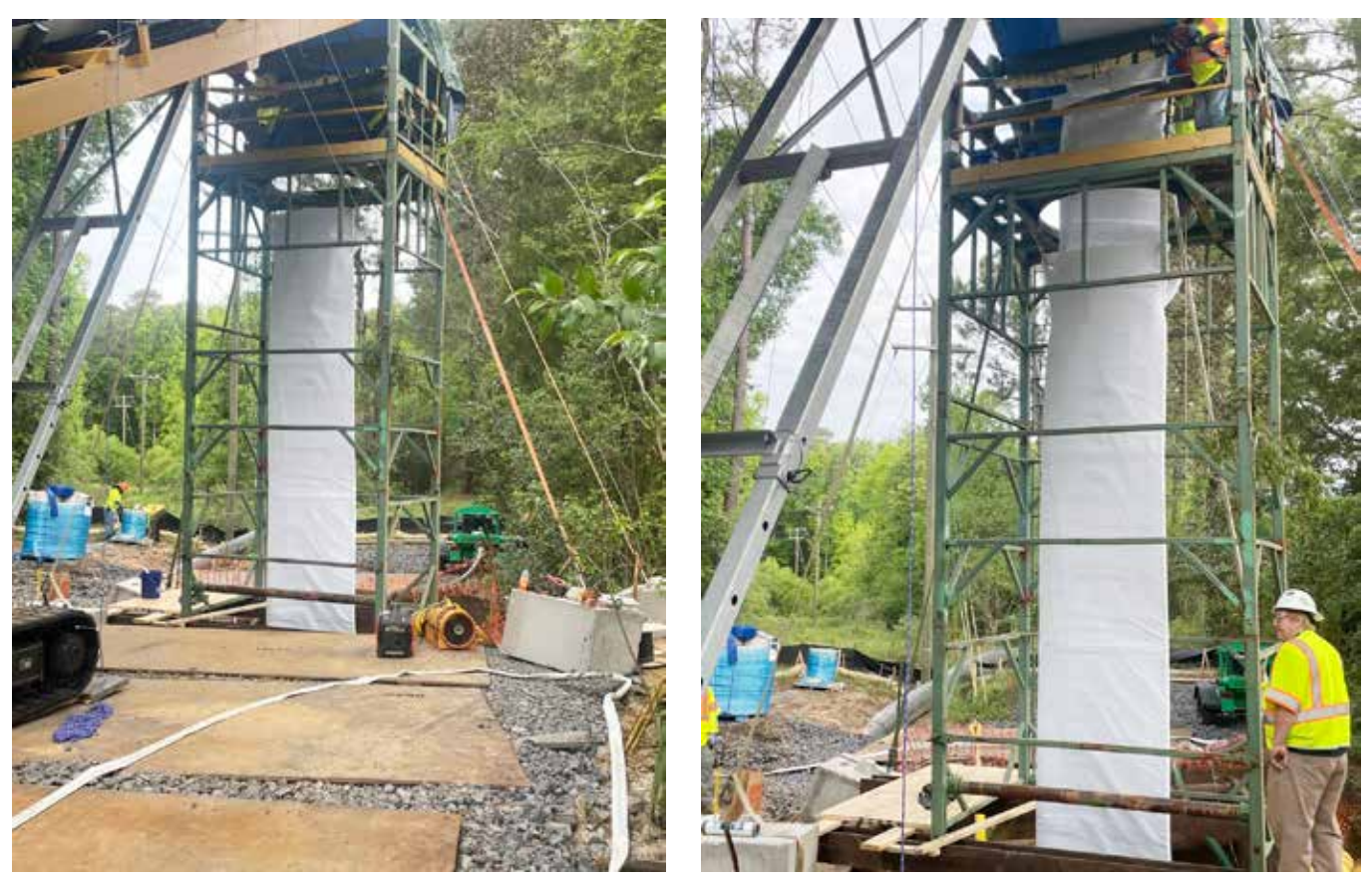
Historically, installations of extremely long lengths and larger diameters are accomplished with the "Over-the-Hole" method

material with the resin system and is done in a highly controlled facility environment under strict quality controls that far exceed field wetout conditions. The wet tube was then shipped in refrigerated trucks to the jobsite in South Carolina sequentially for each installation and phase of the job.