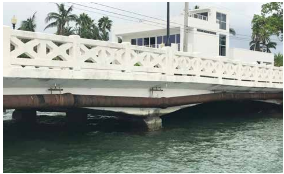
Existing water main aerial crossing showing significant joint deflection, pipe corrosion, and pipe support failures

design-build, consisted of approximately 3,500 linear feet of 20-inch HDPE force main installed primarily via Horizontal Directional Drill (HDD).