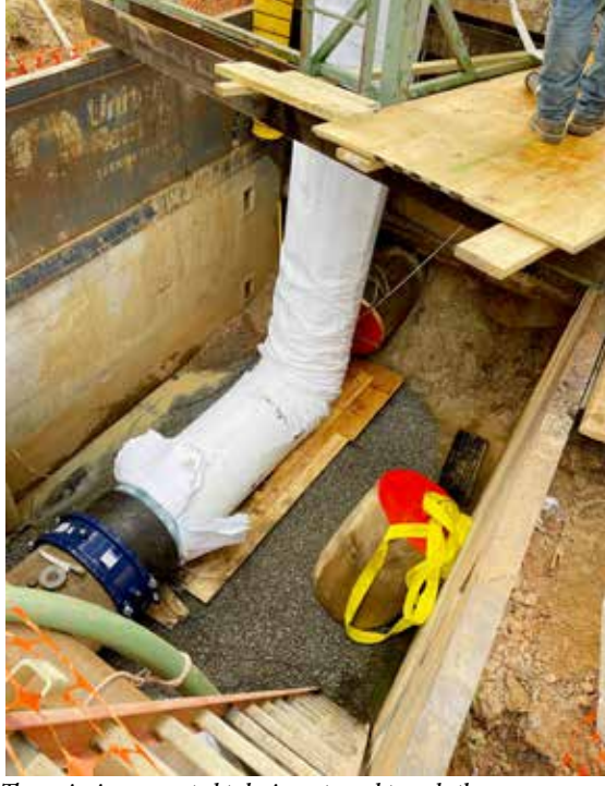
The resin-impregnated tube inverts and travels the length of the host pipe

A recent updated approach to CIPP lining in pressure pipe applications was utilized in this installation. Fiberglass reinforced plastic (FRP) spool pieces were used as end terminations in order to terminate the CIPP liner. Historically, CIPP liners in pressure pipe applications terminated directly onto the host pipe and were either cut flush or were cut back a few inches and a mechanical end seal was applied to seal the CIPP/host pipe